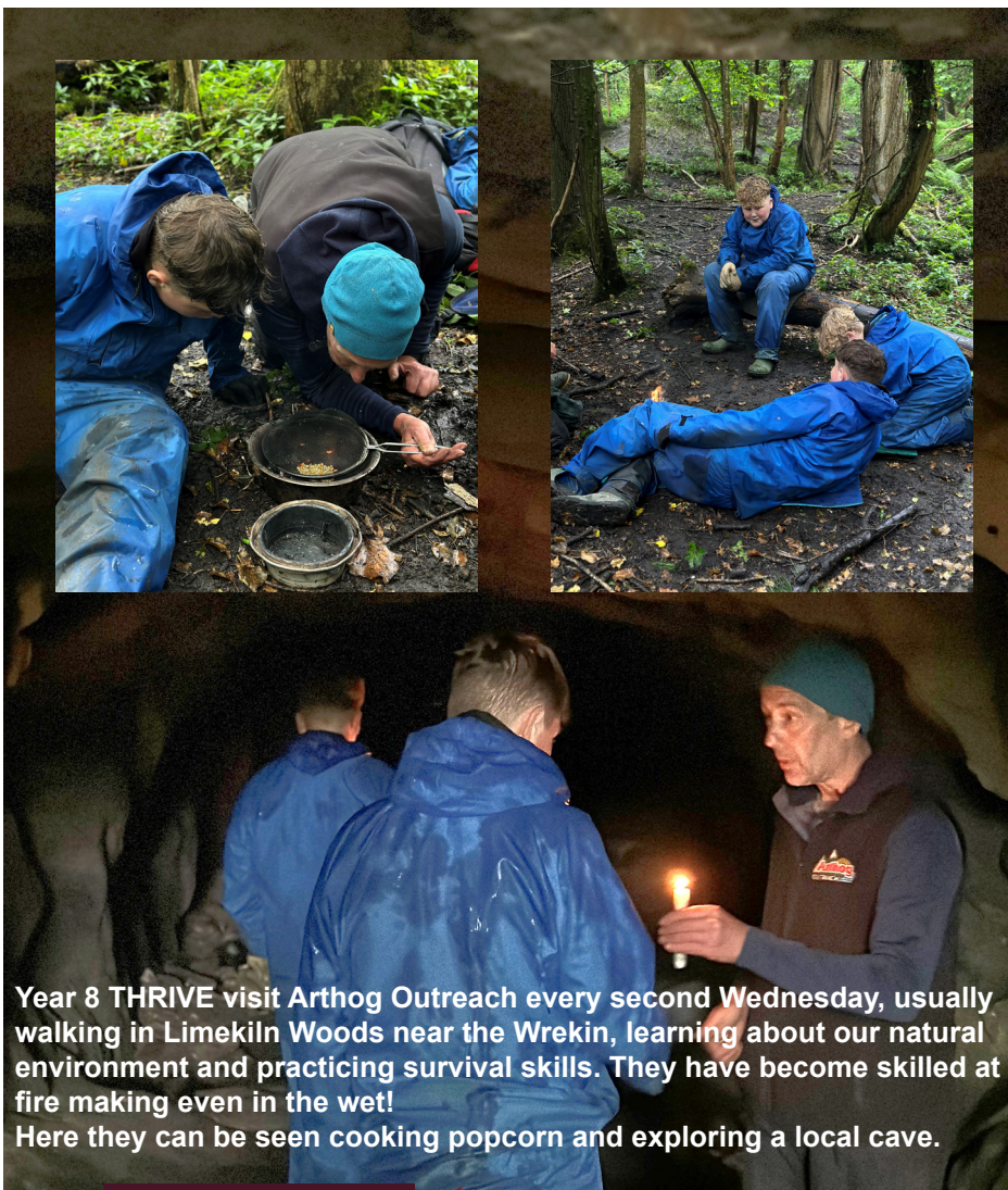
Year 8 THRIVE visit Arthog Outreach every second Wednesday, usually walking in Limekiln Woods near the Wrekin, learning about our natural environment and practicing survival skills. They have become skilled at fire making even in the wet! Here they can be seen cooking popcorn and exploring a local cave.

9E2 have been improving their colour mixing and painting skills in art this week. They have painted 3D forms as part of their Inside/Outside project.