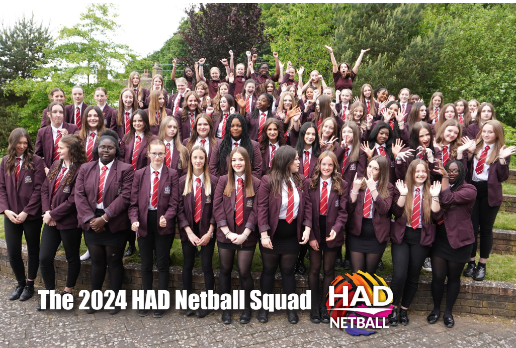
The 2024 HAD Netball Squad