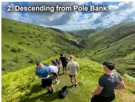
2. Descending from Pole Bank