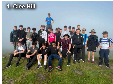
1. Cleve Hill